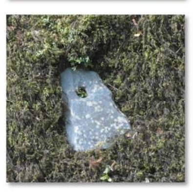
Figure 3 – A finished stone, part of a castle window, was discovered this summer. A vertical groove, designed to receive leaded glass, is clearly visible. Note also the

Figure 4 – Several tapered slates were found, suggesting that Ellan Vhow castle had one or more conical towers.