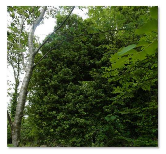
Figure 1 - Ellan Vhow castle overgrown with ivy and threatened by destructive root growth of embedded saplings and mature trees.

There are three "Scheduled Ancient Monuments" amongst the islands of Loch Lomond. These are protected by the Scottish Government as nationally important historic sites and are under the care of Historic Scotland. Two of the three, Inveruglas Isle and Island I Vow (Ellan Vhow), are home to the ruined remains of Macfarlane strongholds .